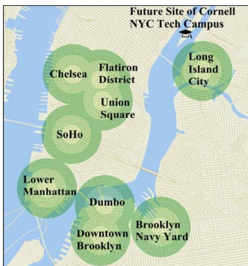
Figure 3 Tech Hotspots in New York City

Lower Manhattan, traditionally home to financial firms and government offices, has become attractive to high-tech and creative firms. With lower rents than other neighborhoods in the borough, Lower Manhattan is easily accessible and increasingly residential. According to Launch LM (an organization devoted to advancing the downtown technology community), Lower Manhattan is home to more than 600 tech-related companies.